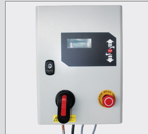
NEMA 4X Smart Start™ NXT control box

The Speed-Commander™ 1400 SEL comes with the next generation, NEMA 4X Smart Start™ NXT control box, which accepts 208 to 575 v / 3-phase / 60 Hz input voltage. The updated control box has a simplified wiring configuration, is more powerful, and has fewer components and cables as compared to the original Smart Start™. A distribution block accepts the activation and protection device wiring; main power cables feed through pre-drilled holes on the bottom of the box where the individual wires, with pre-wired removable terminal blocks, simply plug into the circuit board. There are extra ports on the control board allowing for firmware upgrades and future expansion. A USB port is available for maintenance monitoring. A special UPS emergency battery pack is optional and provides peace-of-mind in case of a power failure. If power is lost to the door, the UPS emergency battery pack automatically opens the door once to allow personnel to quickly exit the area.